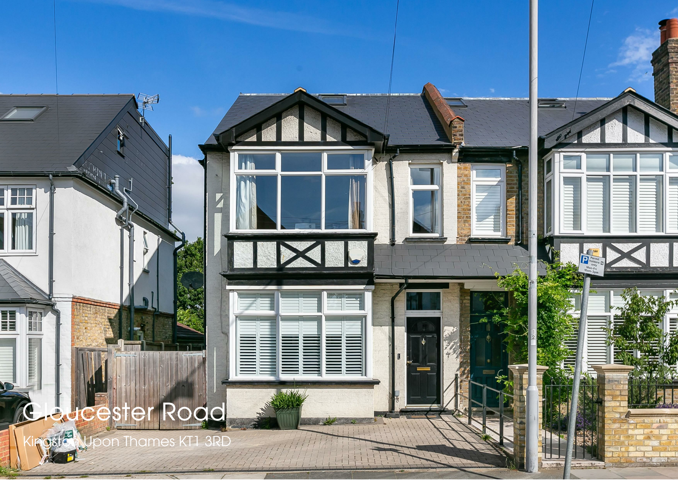
Gloucester Road Kingston Upon Thames KT1 3RD